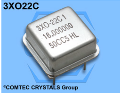
Crystal Clock Oscillator 3XO-22C5.0 DIL 8 5.0V