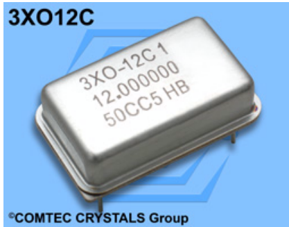
Crystal Clock Oscillator 3XO-12C5.0 DIL14 5.0V