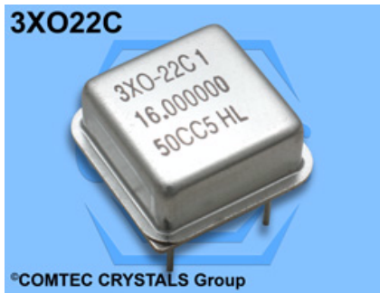
Crystal Clock Oscillator 3XO-22C5.0 DIL 8 5.0V